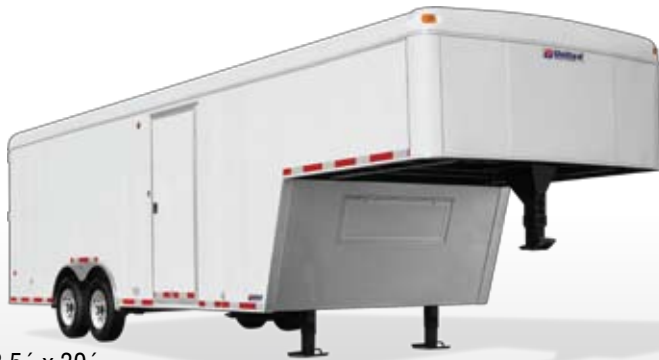
8.5' x 30' U-Series Gooseneck Model