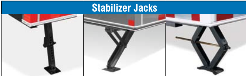
Light-Duty 1,000 lb. Fold Down

Custom cabinets are our specialty, and several standard cabinet layout options are also available.