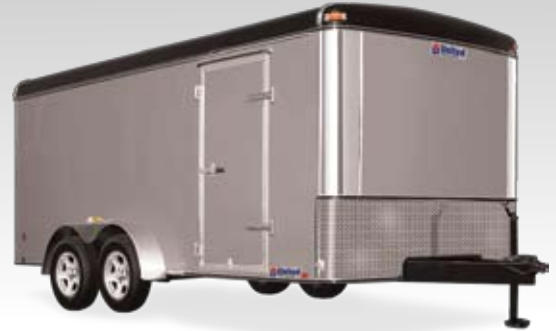
7' x 16' U-Series tag unit with optional bright aluminum front corners and aluminum Star wheels.