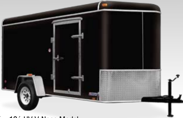
6' x 12' UV V-Nose Model