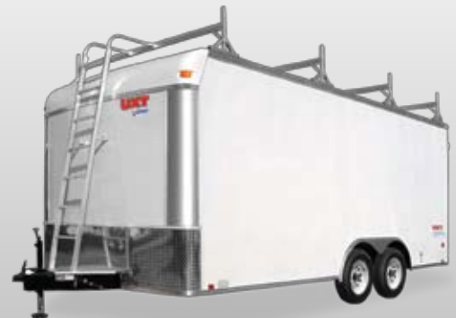
UXT 8.5' x 18' with optional ladder racks and ladder.