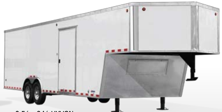
8.5' x 34' UXVGN