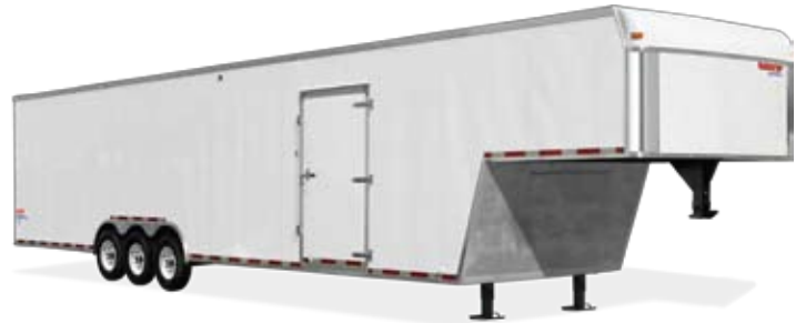
8.5' x 44' UXT Gooseneck Model