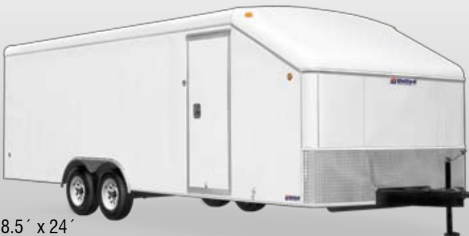
8.5' x 24' USN Slope-Nose Model