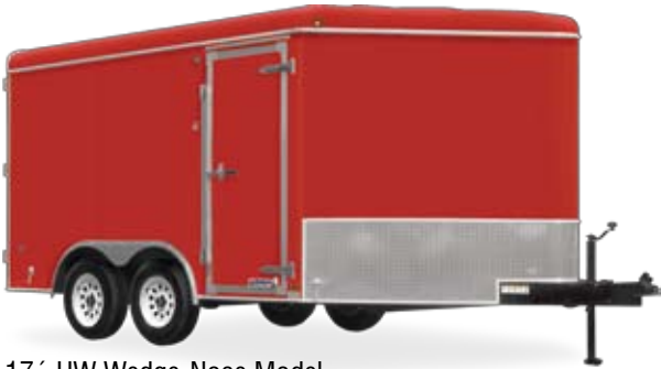
8.5' x 17' UW Wedge-Nose Model The wedge-nose models come with a 5' wedge.